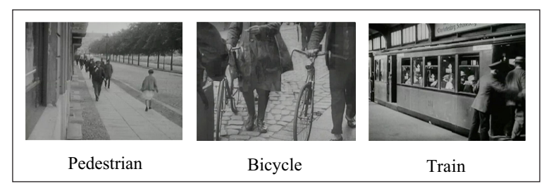
Figure 3: "Trains – Walk – Bikes" Template.