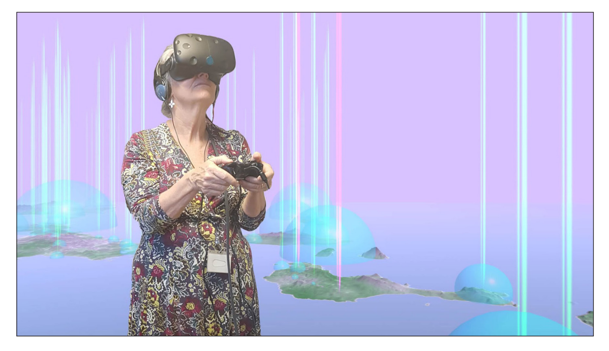
Figure 1: Glossopticon VR Visualization-Game engine version.

Glossopticon (see Figure 1 ) is a virtual reality-based information visualization system that presents archived heritage audio and related metadata in an immersive spatial environment. A central aim of Glossopticon is to visualize (and sonify) the PARADISEC collection (PARADISEC 2022), thus creating a new access point into an archival database, which holds records of 1,202 languages of the Pacific region, many of which include audio recordings. There are close to 9,700 hours of recordings in PARADISEC, and from these recordings, we extracted short snippets with links back to the full content in the existing PARADISEC web portal. The process of creating these snippets and some of the implications of choosing to extract these using a semi-automated process is described in the paper "Nura Yaman ('Country Speaks'): Language, People and Place in Serious Games" (Burrell, Hendery, and Hromek 2021).